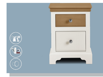
HMB301 2 Drawer Bedside

As well as this, we can also offer you the option of having the top drawers in Oak, matching the tops of the cabinets. Alternatively, you can opt to have this top drawer painted to match the rest of the unit.