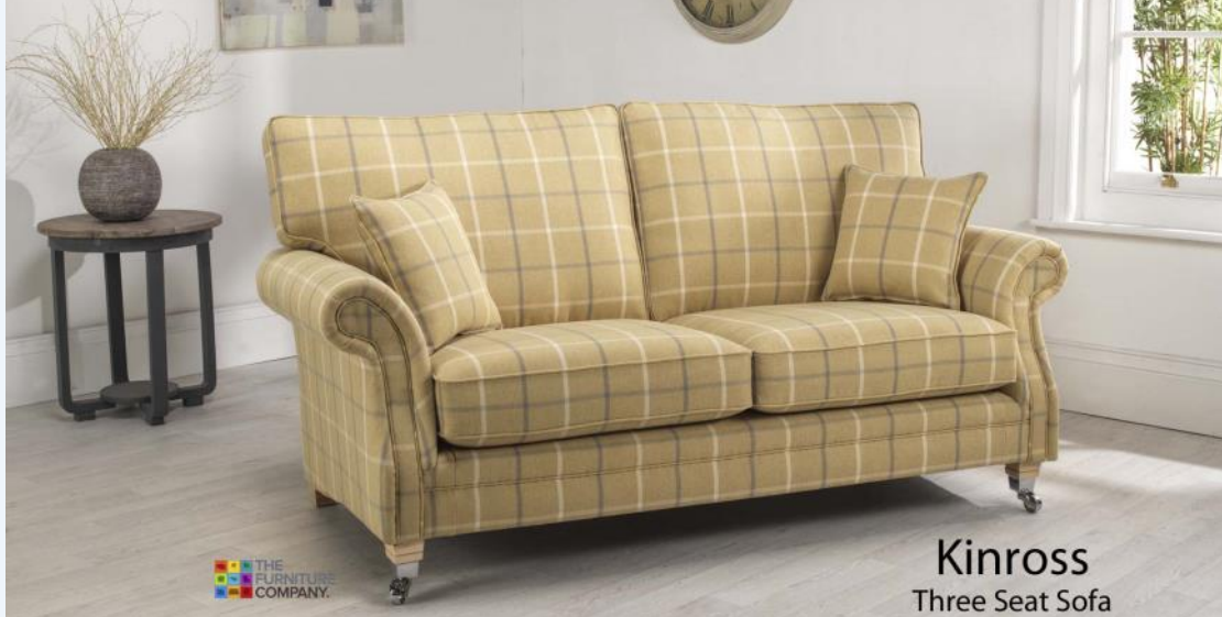
Kinross Three Seat Sofa